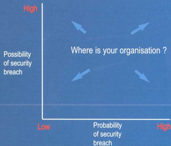
Volatility Index - Probability of security breach versus possibility of attack breach